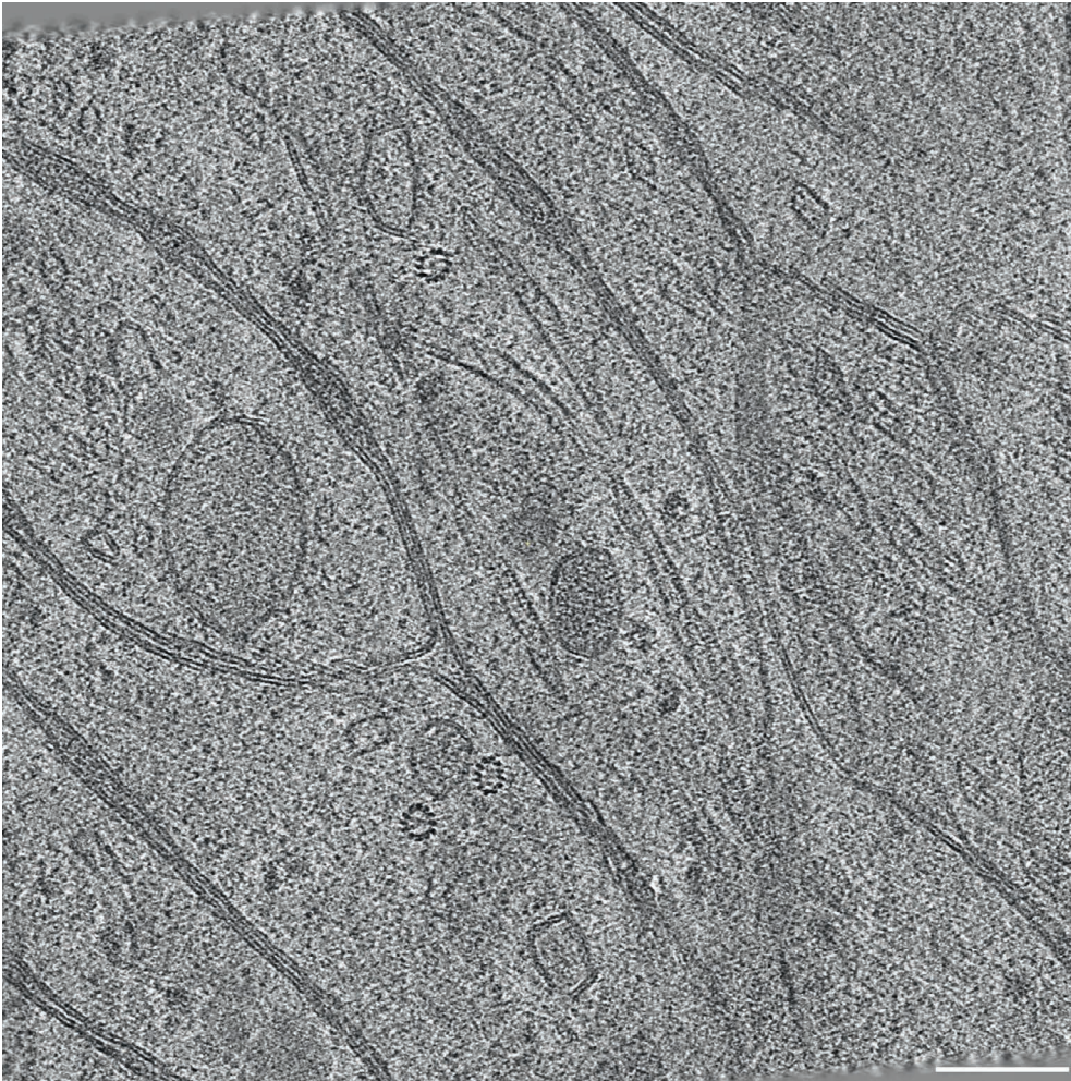
Drosophila embryonic brain axons. Defocus -4\mu\text{m} , no phase plate Tomographic reconstruction, computational 5nm slice. M. Eltsov, IGBMC, Strasbourg Scale bar: 100nm